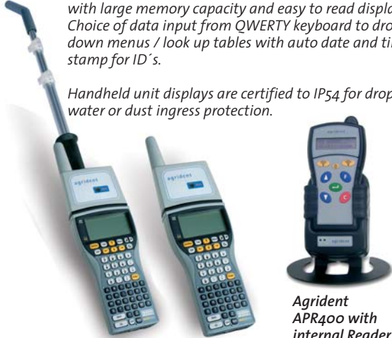
MX Extension Reader

Handheld unit displays are certified to IP54 for drop and water or dust ingress protection.