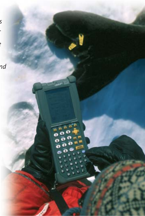
Agrident APR400 with internal Reader