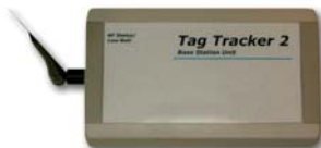
AgInfoLink Tag Tracker Base Station