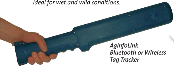
AgInfoLink Bluetooth or Wireless Tag Tracker

Able to work in conjunction with most management systems and with a re-chargeable 6 hour battery. Ideal for wet and wild conditions.